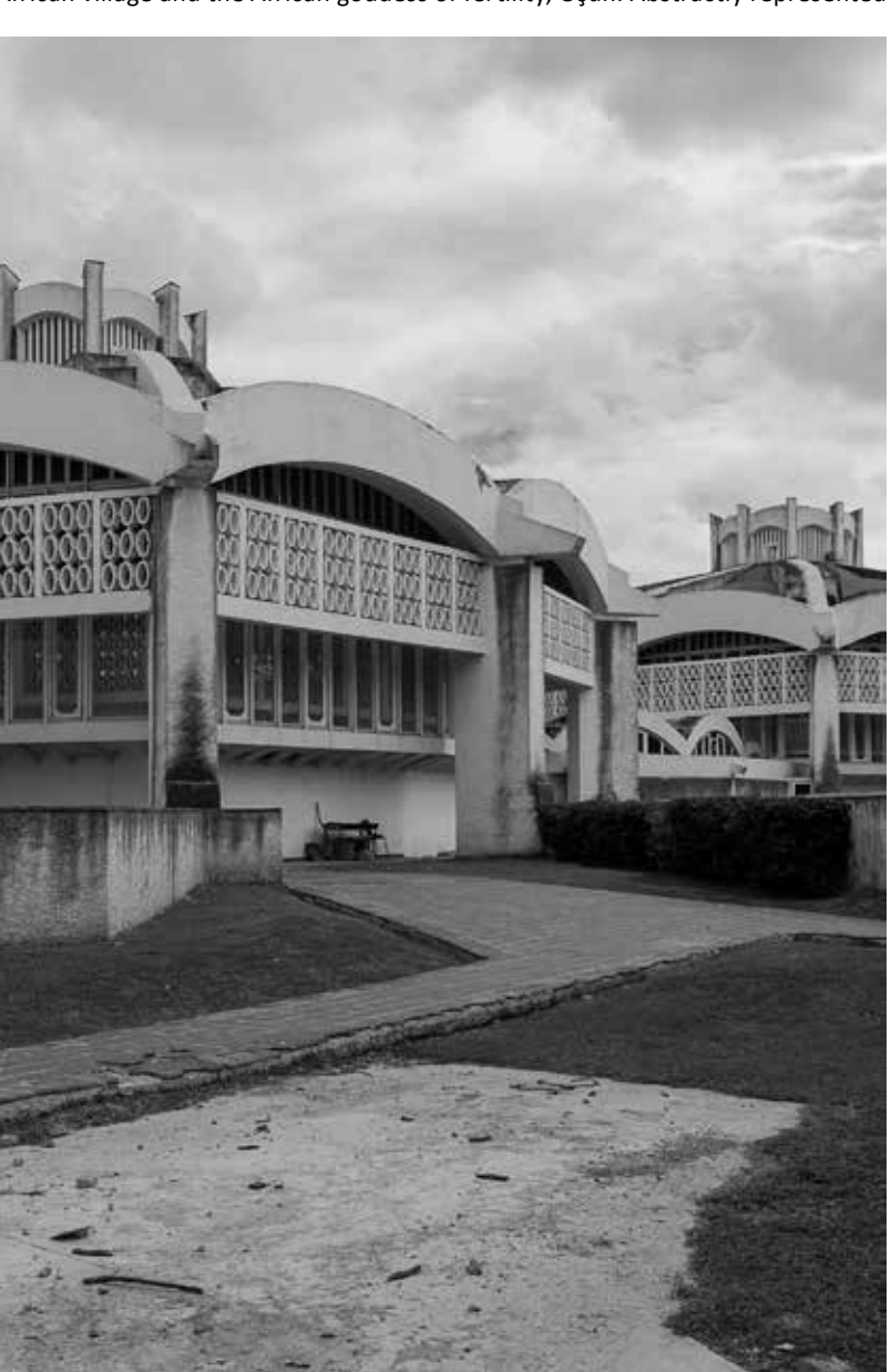
Figure 1. Ricardo Porro, Escuela Nacional de Danza Moderna, Cubanacán, 1961–1965 (Image by author).

He also designed the Escuela Nacional de Artes Plásticas (National School of Plastic Arts). Its form is marked by sinuosity and sensuality, even eroticism, in the plan and section of the patio, galleries, and art studios, although it is also contrasted with the rectilinearity, in this case, of the offices, lecture halls, and engraving studios. The design is inspired, not by European influences, but by an African village and the African goddess of fertility, Òşun. Abstractly represented